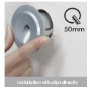
Installation with clips directly