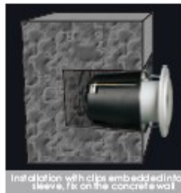
Installation with clips embedded into sleeve, fix on the concrete wall